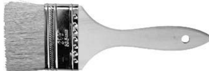
Wood Handle Natural Bristles