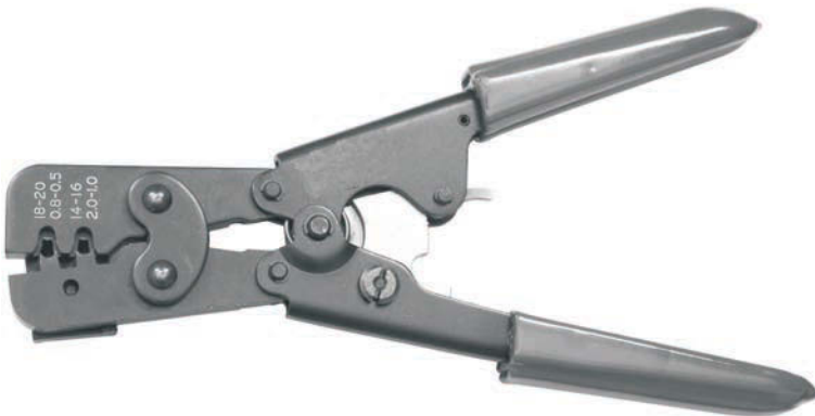
20751 (GM: 12014254)

Weather Pack Crimping Tool designed specifically to crimp only Weather Pack 20-18 Gauge & 16-14 Gauge Weather Pack seals and terminals in one cycle. Ratchet mechanism ensures completion of cycle.