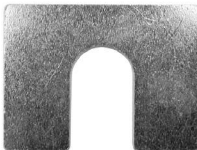
2" x 1-1/2" w/ 5/8" Slot Zinc