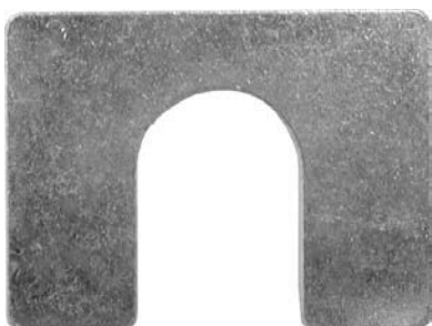
2" x 1-1/2" w/ 3/4" Slot Zinc

8445 1/8" Thick (10 Gauge Steel) UNIT PACKAGE: 50