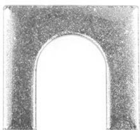
1-3/8" x 1-1/4" w/ 5/8" Slot Zinc