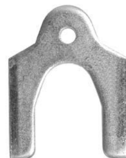
1-3/16" x 1-15/32"