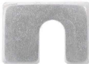
1-3/4" x 1-1/4" w/ 1/2" Slot Zinc

3155 1/16" Thick UNIT PKG: 100 3156 1/8" Thick UNIT PKG: 100