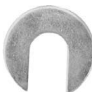
15/16" O.D. w/ 3/8" Slot Zinc

20448 1/16" Thick UNIT PKG: 50 20449 1/8" Thick UNIT PKG: 50