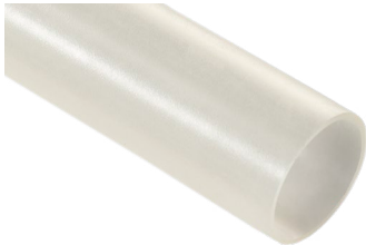
25027 & 25105