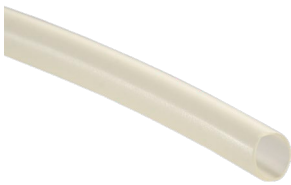
25024 & 25102