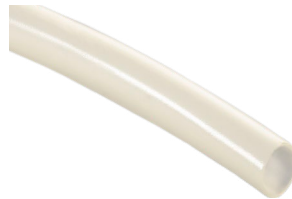
25025 & 25103