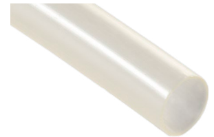
25026 & 25104