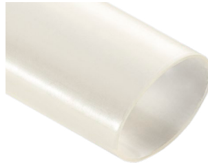
25028 & 25106