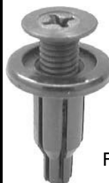
18119 (91502-SP0-003) Black Nylon

Same As 17144 Except For Packing UNIT PACKAGE: 50