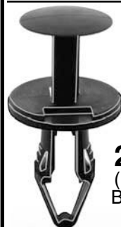
20992 (11589294) Black Nylon

Bumper Fascia, Fender And Toe/Floor Panel Push-Type Retainer Head Diameter: 20mm Stem Length: 24mm Panel Range: 7.0mm - 10.0mm Fits Into 8.5mm Hole Buick Enclave & LaCrosse, Chevrolet & GMC C & K Trucks, GMC Acadia, Hummer H3 and Saturn Outlook 2005 - On