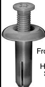
18951 (MR-138807) Black Nylon

Refer To Push-Type Retainer Specification Chart On Pages 450 - 460