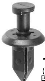
16625 (10108746) Black Nylon

Listed smallest to largest first by Head Diameter then by Stem Length and then by Hole Diameter