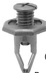
17144 (91504-SM4-000) Black Nylon

Bumper Fascia Push-Type Retainer Head Diameter: 20mm Stem Length: 24mm Fits Into 10mm Hole Honda Accord 1990 - On