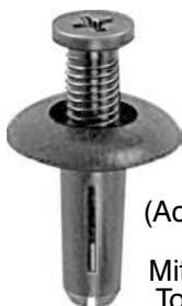
19140 (Acura: 90505-SL0-003; GM: 94852368; Mitsubishi: MB888869; Toyota: 90467-08155) Black Nylon

Push-Type Retainer Head Diameter: 20mm Stem Length: 21mm Fits Into 8mm Hole Acura, Dodge Avenger, Eagle Talon, Geo Prizm, Mitsubishi Eclipse & Galant and Toyota 1993 - On