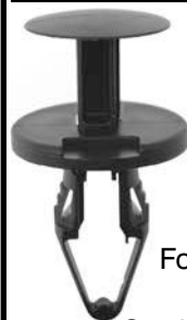
20889 (GM: 11589293; Ford: W712196-S300) Black Nylon

Cowl Vent & Fender Push-Type Retainer Head Diameter: 20mm Stem Length: 22mm Panel Range: 4.5mm - 7.0mm Fits Into 8.5mm Hole Buick Century, LaCrosse & Regal, Cadillac, Chevrolet Equinox, GM Trucks, Hummer H3 and Pontiac Grand Prix & Torrent 1997 - On Ford 2006 - On