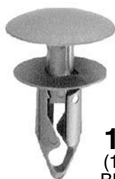
19615 (15153415) Black Nylon

Rear Bumper Cover Push-Type Retainer Large Head Diameter: 20mm Stem Length: 21mm Fits Into 9mm Hole GM C & K Trucks 1999 - On